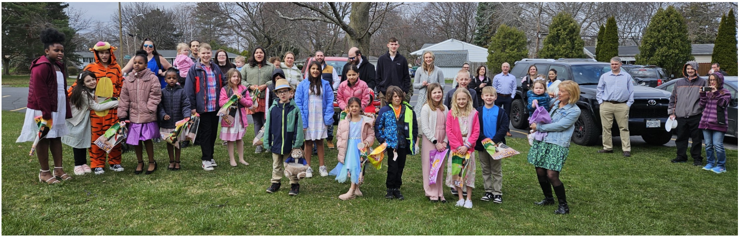
This year's Easter Egg Hunt drew the largest crowd we've ever had hunting for egg around the church grounds!