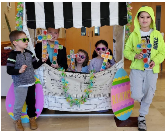
Having fun on Easter Sunday!

Youth Group (Grades 8-12) – Fridays, May 12 th and 26 th at 7pm.