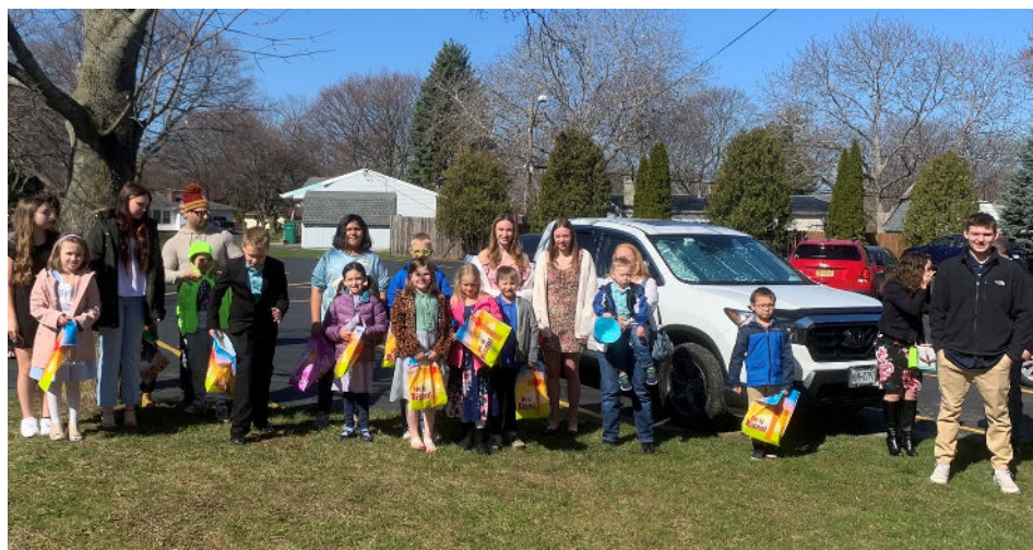
Helpers and participants in this year's children and youth Easter Egg Hunt