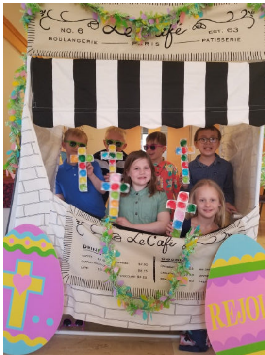
Easter Sunday Joy!