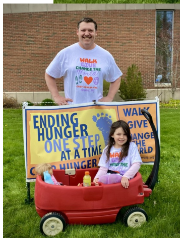
This year's CROP Hunger Walk participants from Aldersgate. Go Team!!