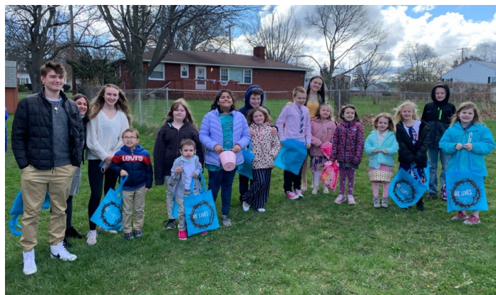
Easter Egg Hunt participants