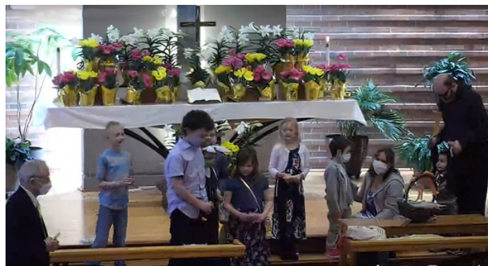
The children recite The Lord's Prayer on Easter Sunday.