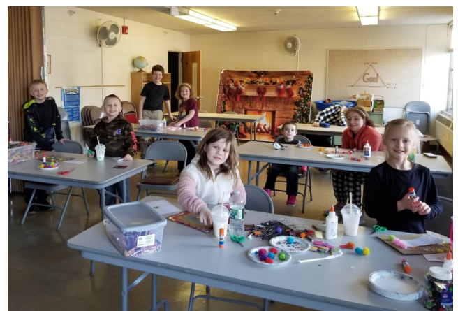
Shamrock Shake Sunday: Children creating an Irish Blessing art project.