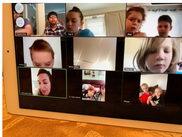
First Zoom Sunday School Class