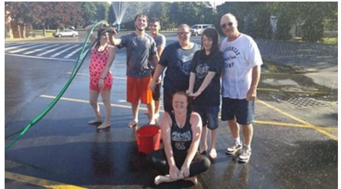
Summer car wash shenanigans