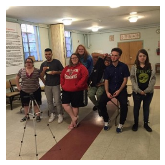
Senior High Youth Group