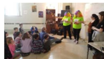
BIBLE LESSON BIBLE TWINS