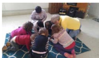
OFFERING CLEAN WATER PROJECT