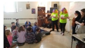
BIBLE LESSON BIBLE TWINS