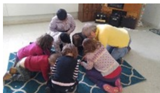
OFFERING CLEAN WATER PROJECT